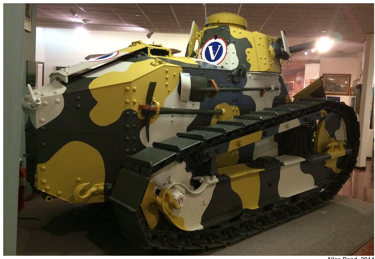
Allen Bond, 2014