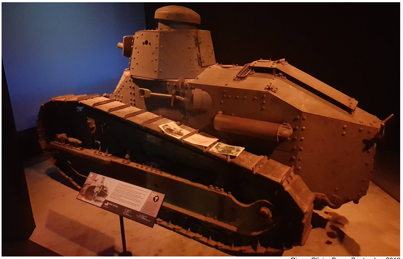
Pierre-Olivier Buan, September 2019

Listed here are the Six Ton Tanks Model 1917 that still exist today.