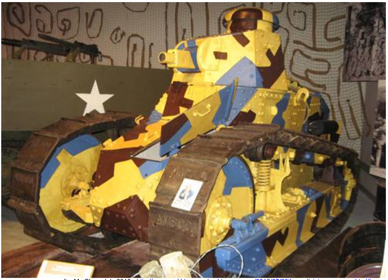
Jim Mc Clure, July 2010 - http://www.yorkblog.com/yorktownsquare/2010/07/28th-pa-division-museum.html#more