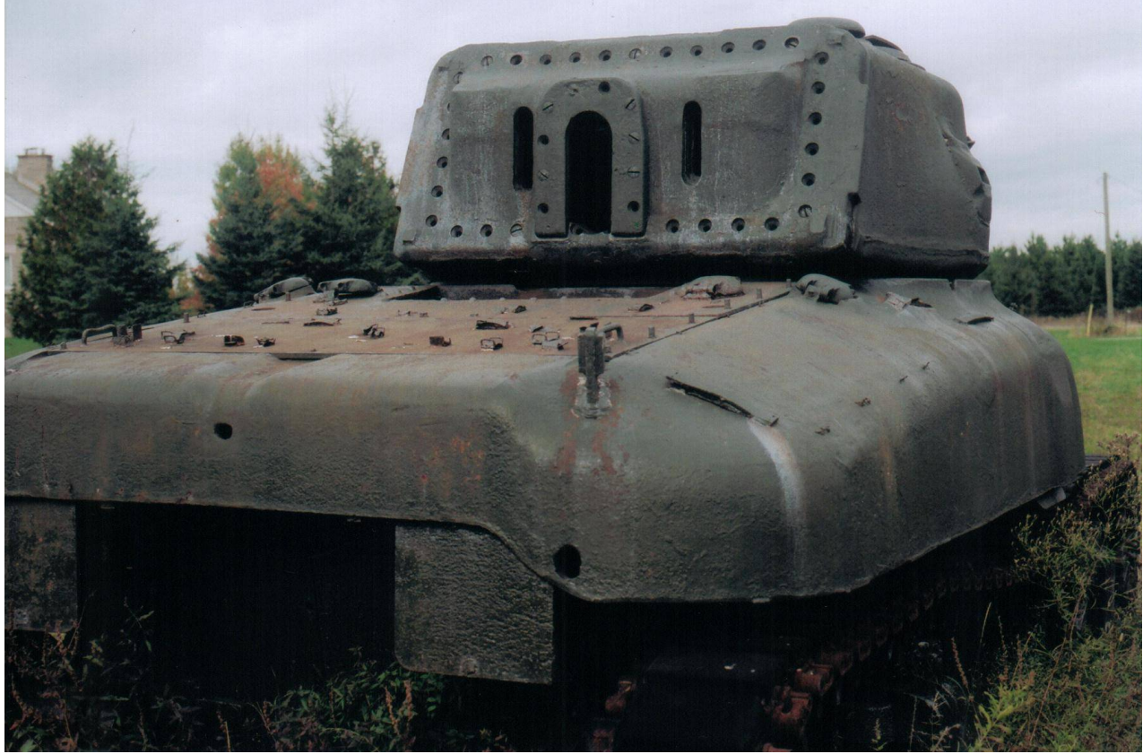
Bruce Clark, October 2007