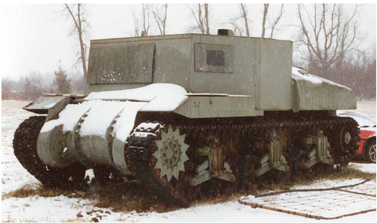
RAM Mk. II wreck – Staman International Trading, Nijverdal (Netherlands) This tank might have been recovered from the Pirbright fire range