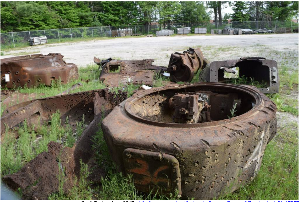
Scott Taylor, June 2017 - http://com-central.net/index.php?name=Forums&file=viewtopic&t=17957

Two RAM Kangaroos APC wrecks and some parts Canadian Forces Base, Borden (Canada) These photos show target #9, target #8, upper hull #38, lower hull #32, turrets #36 and #13