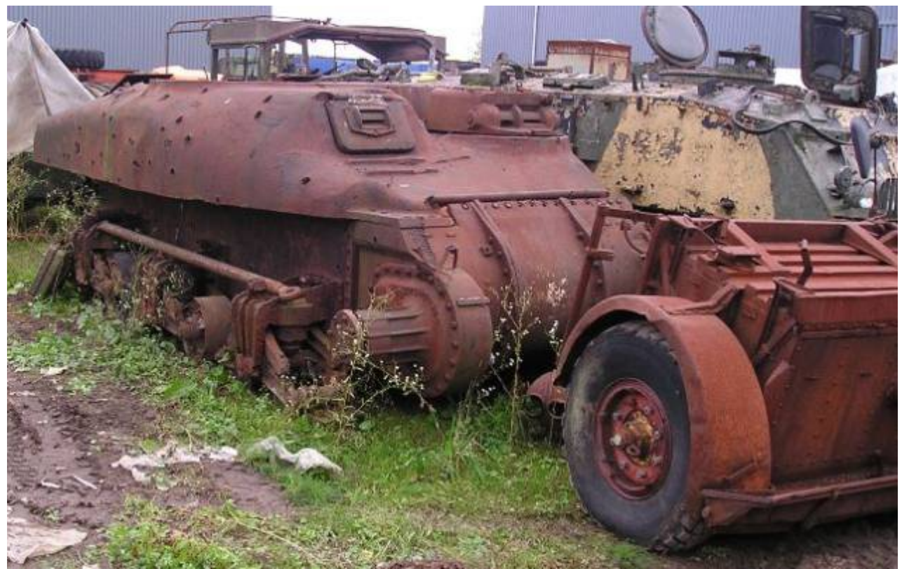
Wim Sikkelbein - http://www.ramtank.ca/ramphotos2.htm