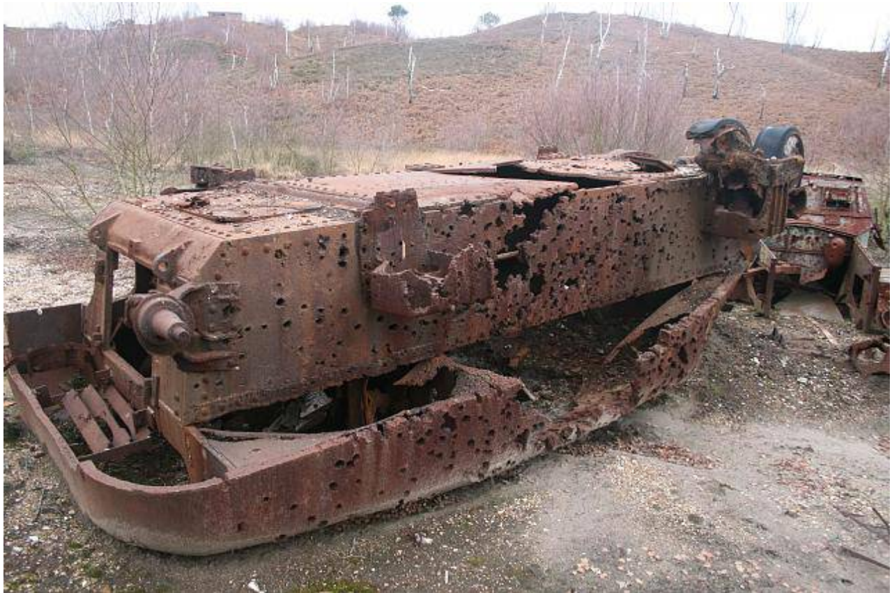
"rog8811", 2007 - <u>http://hmvf.co.uk/forumvb/album.php?albumid=347</u>