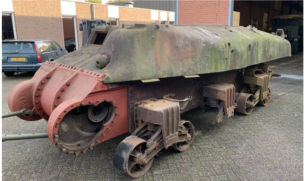
Auke Dijkstra, November 2020