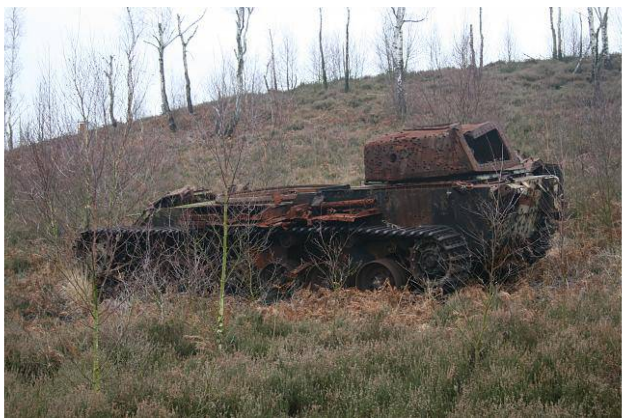
"rog8811", 2007 - http://hmvf.co.uk/forumvb/album.php?albumid=347