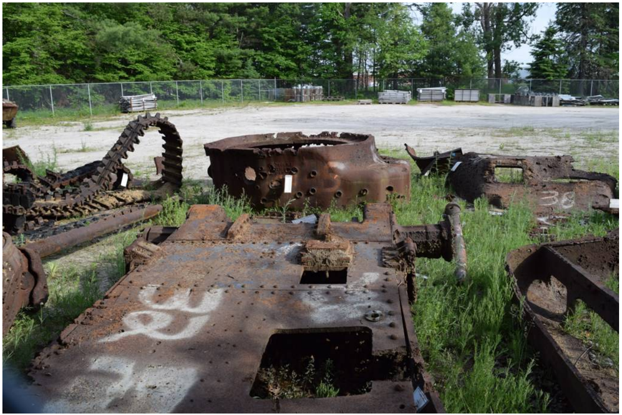
Scott Taylor, June 2017 - http://com-central.net/index.php?name=Forums&file=viewtopic&t=17957