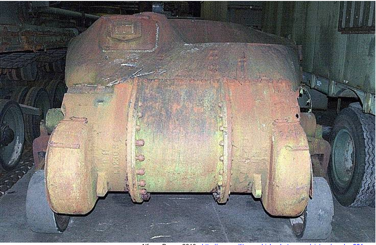
Alf van Beem, 2010 - http://www.military-vehicle-photos.com/picture/number961.asp

Ram Kangaroo APC – Australian Armour and Artillery Museum, Cairns, QLD (Australia) Restored by Carl Brown. Shop No.1141 CT-40921. This vehicle comes from the Fingringhoe Ranges, Colchester, Essex, UK