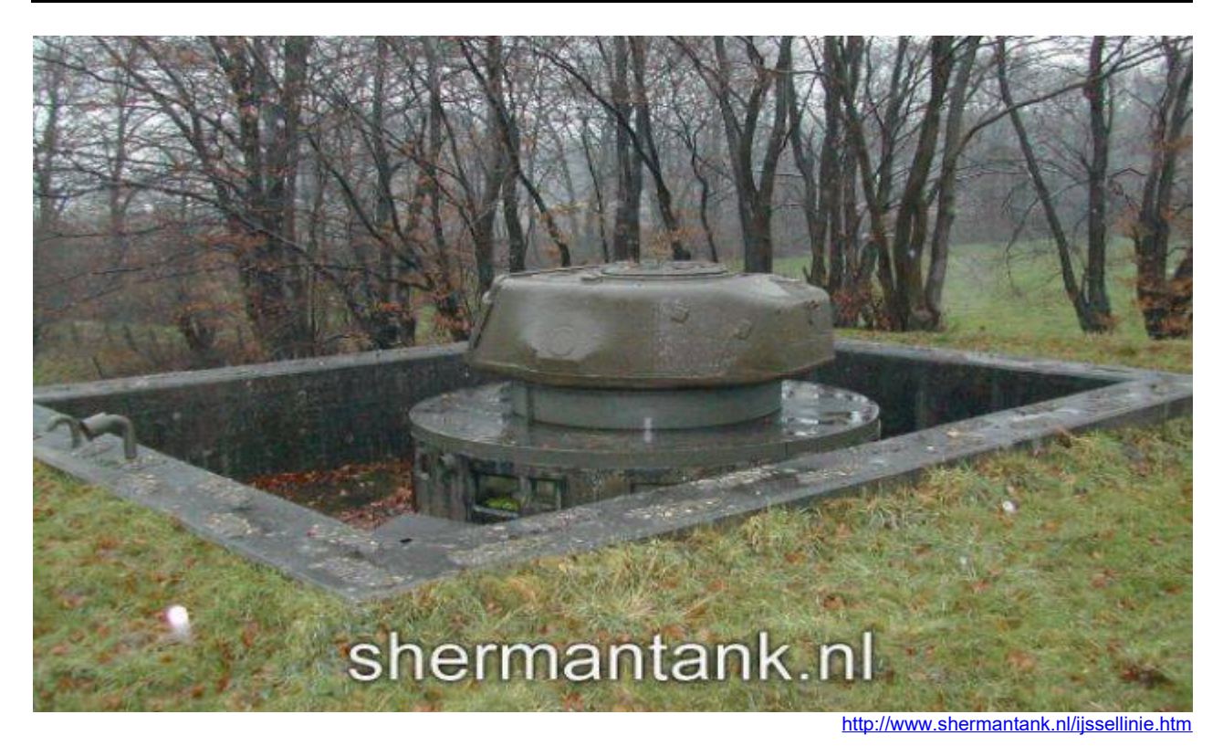
2 RAM turrets

RAM turret – Along the road N337 to Deventer, near Olst (Netherlands) This turret is part of the Ijssel Linie