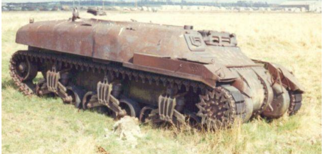
Picture taken in the mid-80s - http://web.inter.nl.net/users/spoelstra/g104/kangaroo.htm

RAM Kangaroo APC – Canadian War Museum, Ottawa (Canada) Shop No.1112, CT-40892 (Sherman register). This vehicle went from a firerange in UK to a British dealer/collector, then to a Dutch dealer/collector, then to a Belgium dealer/collector who finally traded it to the Canadian War Museum. It is awaiting restoration. The picture shows the vehicle while it was still on the firerange (<u>http://www.hmvf.co.uk/</u> forum)