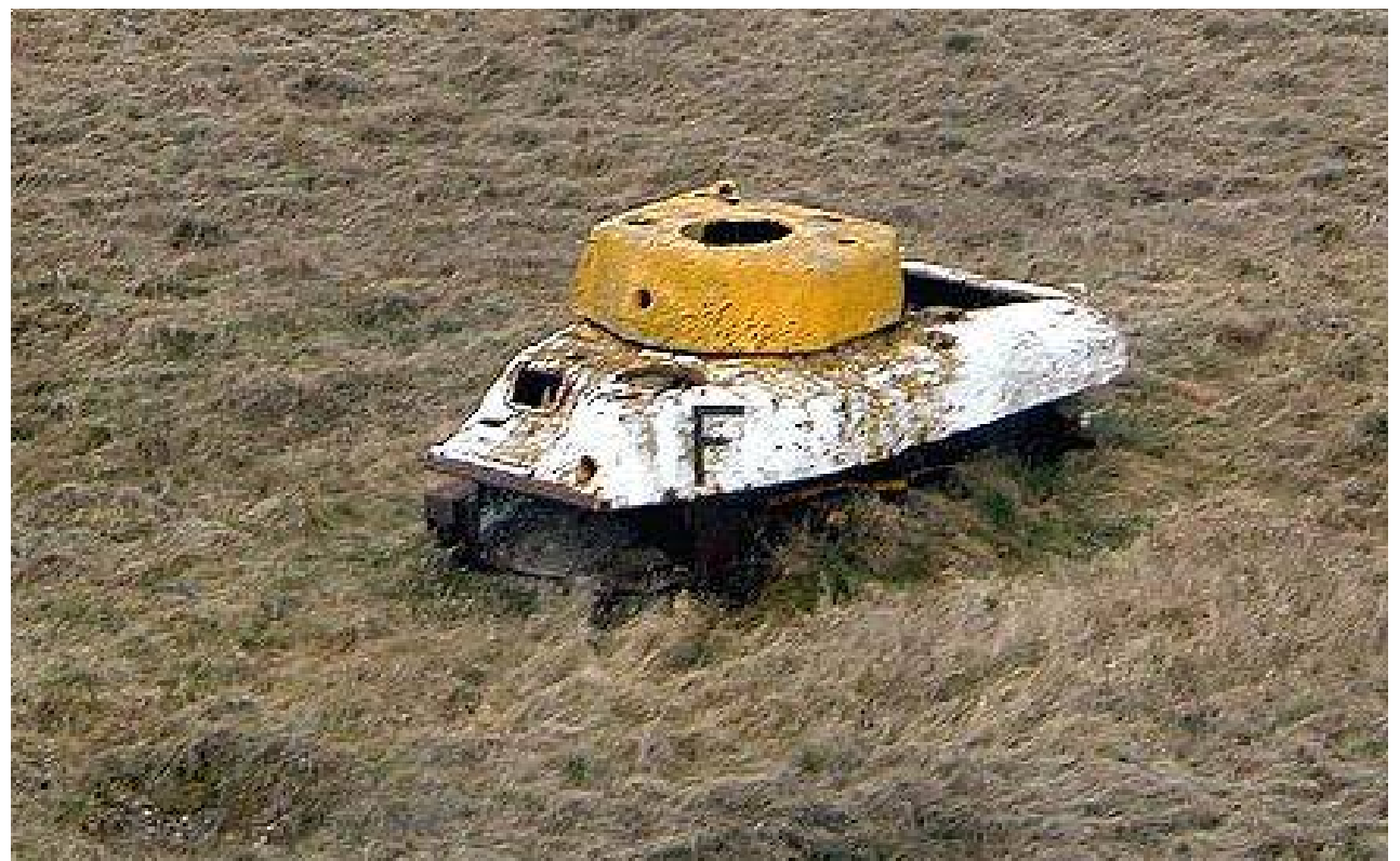
"plainmilitary" - http://s144.photobucket.com/albums/r183/plainmilitary/Plain%20Military%20wrecks/?start=12

RAM Mk. II (late) wreck – Salisbury Plain firing range (UK) Shop No. 1277 CT159521 . This vehicle has donated many parts to other restorations despite having previously been a target, buried, dug up and used as a target again (David Herbert)