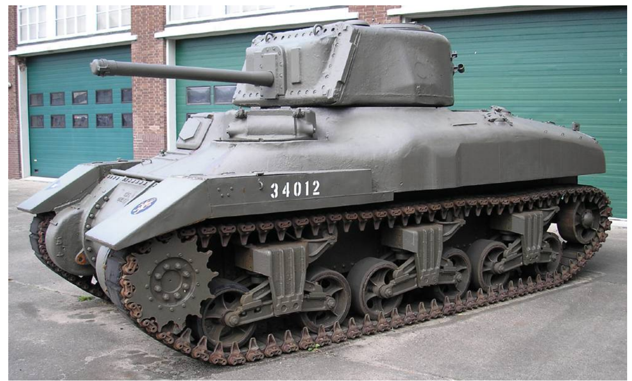
Michel Krauss, 2005 - http://s1015.photobucket.com/

RAM ETT Lit (Evasive Target Tank) – Dutch Cavaleriemuseum, Amersfoort (Netherlands) This tank was part of a batch of forty-four Rams delivered to the Netherlands in 1947. At least two tanks from this batch were target training tanks, used as a mobile target for light weapons (that's why every opening has been welded over) (Michel Krauss and Hanno Spoelstra)