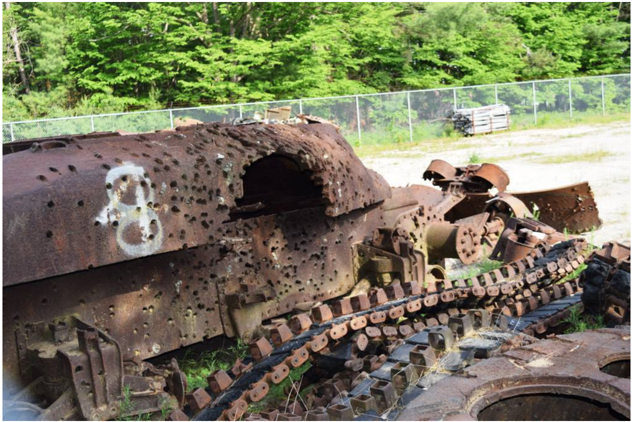
Scott Taylor, June 2017 - http://com-central.net/index.php?name=Forums&file=viewtopic&t=17957