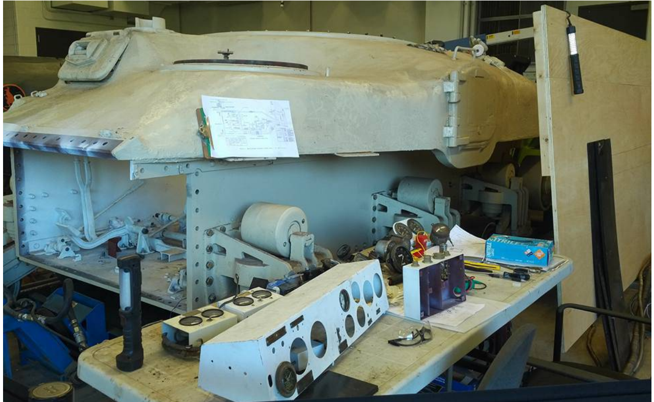
David Gough, September 2017 - https://www.facebook.com/groups/ERAssociation/