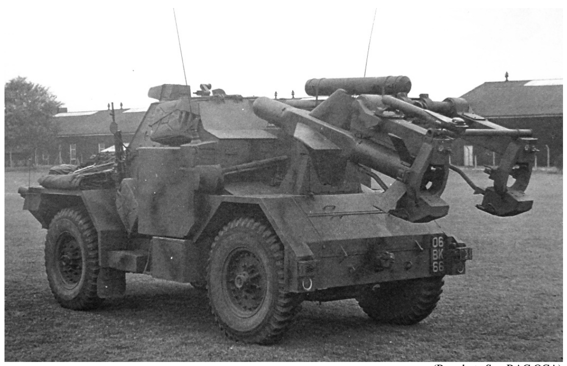
(Parachute Sqn RAC OCA)