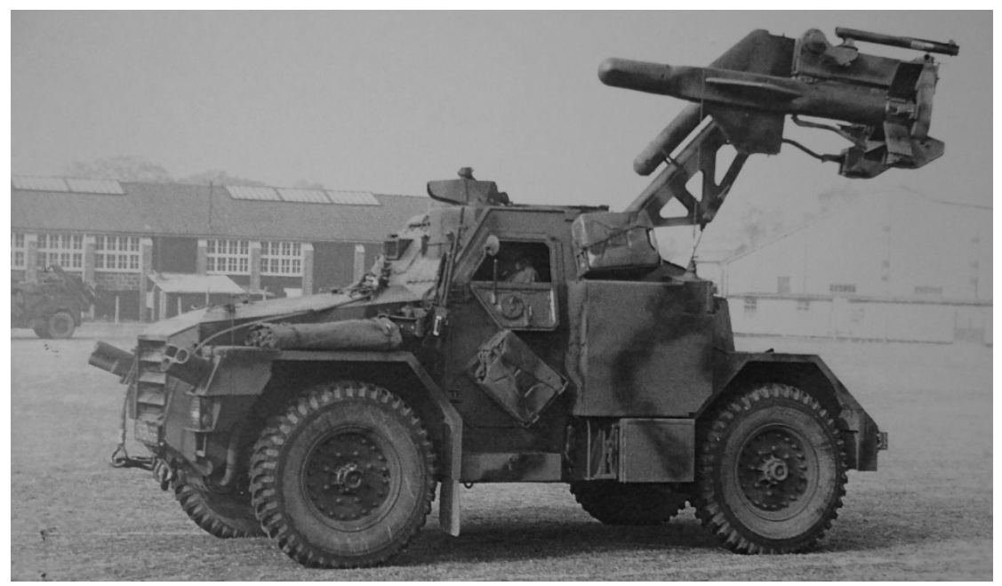
(Parachute Sqn RAC OCA)